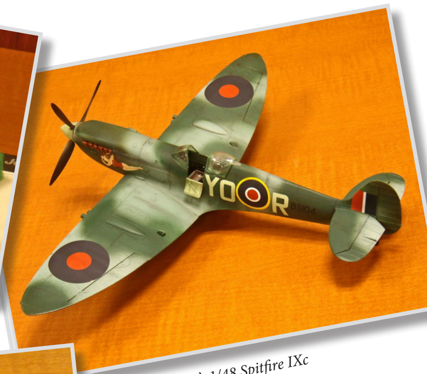
Nick Buro's 1/48 Spitfire IXc