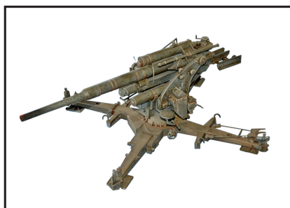
Model: German 88mm Gun