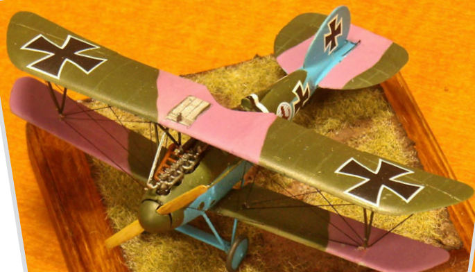
Rick Verriest's 1/72 Albatross D.V