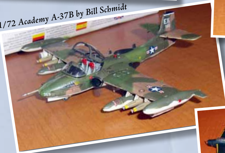
1/72 Academy A-37B by Bill Schmidt