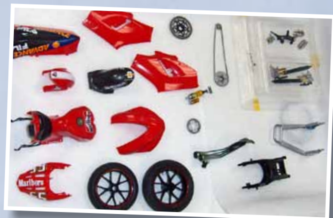
1/12 Ducati Motorcycle in process by Jim Boulukos

There were some neat models on the table this month. Not many but neat. Despite the paucity of models there was a good mix – aircraft, a ship, a motorcycle and a tank. Several were works in progress. C'mon guys! Bring something! Anything! 🛡️